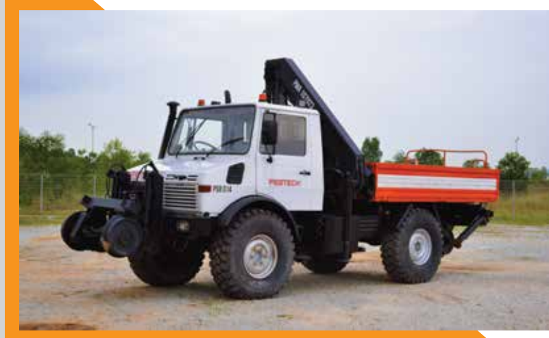
Road / Rail Tip Truck with 10t Crane /Man Bucket (Unimog) Mercedes Unimog - 9 Tons/m crane

Machinery Task - Mast installation, transport unwanted soil off the working area to the allocated dumping area and for any OCS work at height (to use the crane with its manbucket)